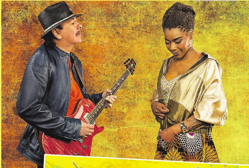
The evergreen Carlos Santana and singer Buika.